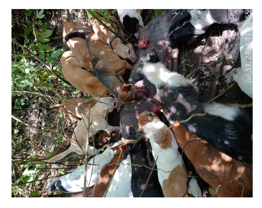
Figure 2. Wild boar hunting activities in West Pasaman Regency using hunting dogs

ric data were then used to estimate the body weight of wild boars using the formula of Baruzzi et al. (2023). The muscle samples were then collected from four anatomical sites within the body of the wild boar: The masseter, forelimb, diaphragm, and intercostal muscles. At each site, approximately 50 g of muscle sections were carefully collected using a sharp knife and then placed in a 12×20 cm plastic sample bag. These individual bags were then combined into larger bags measuring 25×35 cm. Subsequently, the samples were stored in a -20 °C freezer for preservation and transportation.