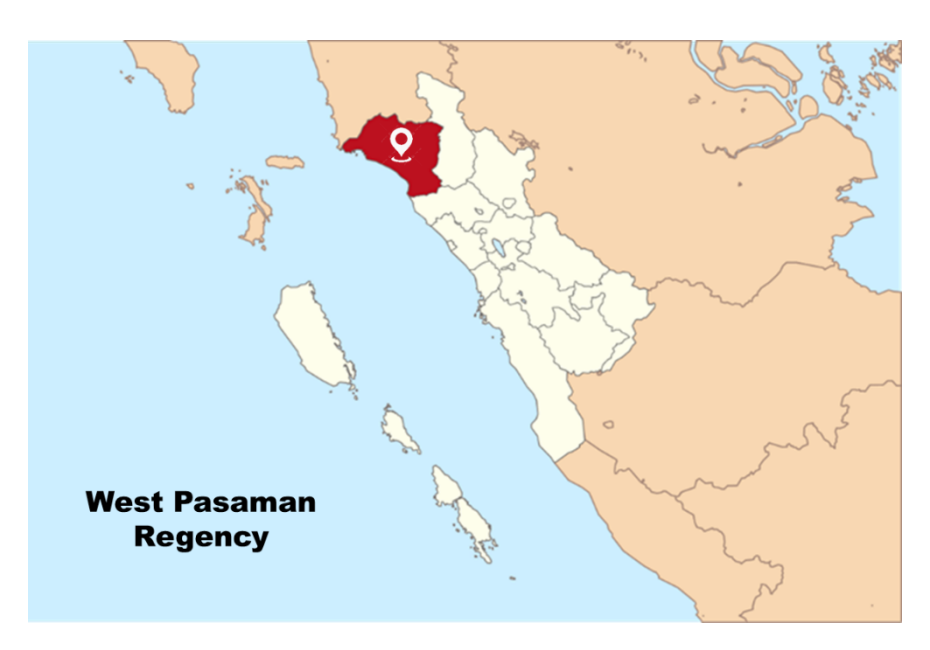
Figure 1. Location of West Pasaman Regency within West Sumatera Province, Indonesia

for this study was calculated based on the formula given by Thrusfield & Christley (2018). The sample size was determined based on the expected prevalence of 50%, a 95% confidence interval, and a desired precision level of 10%, resulting in a minimum sample number of 97 wild boars.