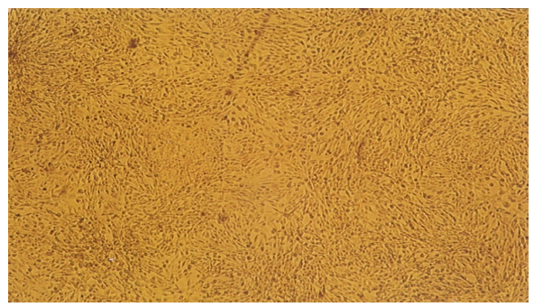
Figure 1: Normal P1LK after 24-48 hr.

After 24-48 hours of incubating cells at 37°C, cells formed a confluent monolayer (Figure 1). The new strain of virus was inoculated into these cells and adsorbed at 37°C for one hour. Cells were then maintained in an incubator for 7-10 days; cells usually degenerated during this period. At first, the cytopathogenic effects (CPE) appeared as small islands; they then gradually attached to each other and degenerated (Figure 2). The culture was then frozen and thawed between two and three times to release the virus completely. The suspension was centrifuged (1,800 rpm) for 20 min. The supernatant was inoculated in the next cell culture. On the final passage after 90-100% CPE was formed, the cultures were frozen at -70°C and then aliquotted into 1.2 ml with 2% lactalbumin hydrolysate and sucrose as a preservative for the vaccine. Vaccine samples were then lyophilized and stored at -20°C.