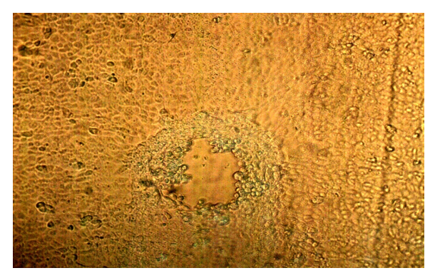
Figure 2: Cytopathic effects in the vero cell line 7-10 days.