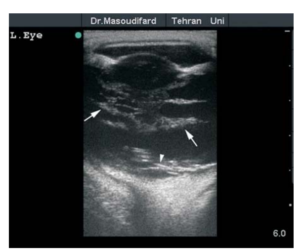
Figure 4: Ultrasonographic scanning of the left eye in a Thoroughbred stallion. Swirling echogenic materials including vitreal debris and fibrin in the vitreous (arrows) and partial retinal detachment (arrowhead) were found.

is one of the clinical findings of many systemic diseases, and inflammation of adjacent ocular structures can manifest itself as a secondary conjunctivitis, a complete general and ophthalmologic examination should be carried out to rule out all systemic and ocular causes of secondary conjunctivitis (Auer and Stick, 2006; Gilger, 2005). It was shown that all examined horses with conjunctivitis suffered from secondary conjunctivitis and showed other clinical signs complications. Due to the impressive appearance of corneal disorders that are easily recognized by horse owners, the relatively large globe size, the normal protrusion of the corneal surface and the environment in which horses exist, ocular traumata and corneal trauma-induced disorders are frequent causes of the so-called "horse's ocular blemishes" in pre-purchase examinations (Auer and Stick, 2006; Launosis et al., 2008). In this study, it was shown that flat-racing horses are much more at risk of ocular traumatic injuries than jump-racing horses. This is probably due to the fact that flat-racing horses are mainly exposed to sand and other solid particles that are thrown up by hooves during high speed races on a sandy race track.