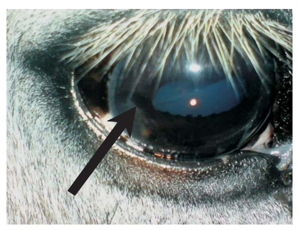
Figure 3: Intra ocular melanoma (arrow) arising from anterior surface of iris, filling the anterior chamber, and in contact with the posterior surface of the corpea

Primary conjunctivitis as a distinct entity is uncommon in horses (Gilger, 2005). Since conjunctivitis