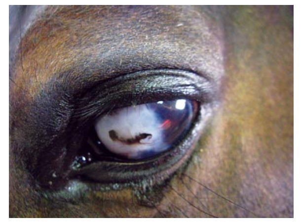
Figure 2: Traumatic induced corneal scarring and pigmentation in the right eye of an 8-year-old mixed breed mare.

Corneal edema due to corneal endothelial damage, which initially is not associated with corneal ulcer and was fluorescein-negative, was diagnosed in three horses with ERU, and in one horse with nonulcerative keratitis. In one of the patients with ERU-induced corneal endothelial dysfunction and corneal edema, rupture of epithelial bullae eventually led to corneal ulceration, possibly as a result of self-trauma. A fluoresceinnegative corneal vascularization and edema were the main signs detected during ophthalmologic examination of an Arabian mare with a history of recurrent ocular disease. Ultrasonographic examination of the affected eye revealed that no other ocular compartment was affected. Nonulcerative keratitis and corneal lesions were controlled with topical dexamethasone. Intraocular melanoma was diagnosed in a 7-year-old grey gelding; there were also lesions in the cervical area and the