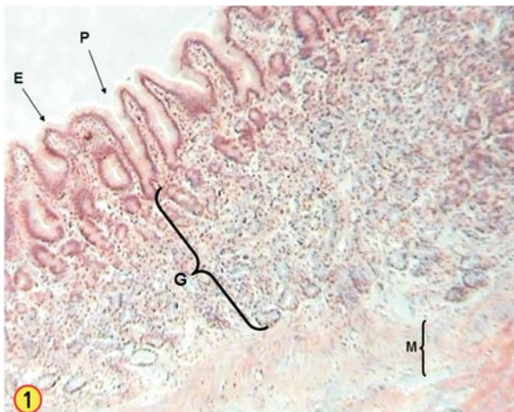
Figure 1: The stomach showing epithelium (E), gastric pit (P), length of gland (G) and muscularis mucosae. H & E staining (×100).