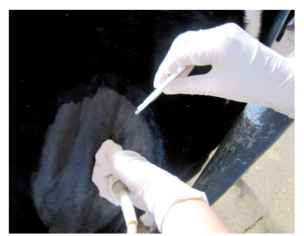
Figure 1. Free hand guidance biopsy technique.