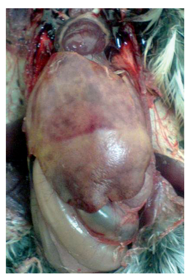
Figure 1. Severe enlargement of the liver with general discoloration of both lobes.

The parasites were also observed in the section derived from spleen. The presence of schizonts and gametocytes in the intestine, especially in the duodenum was recorded (Figure 2D).