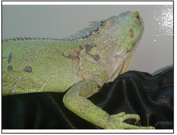
Figure 1. Green iguana with thickening of dark discoloration of the skin surrounding necrosis on the right ventral abdominal region.