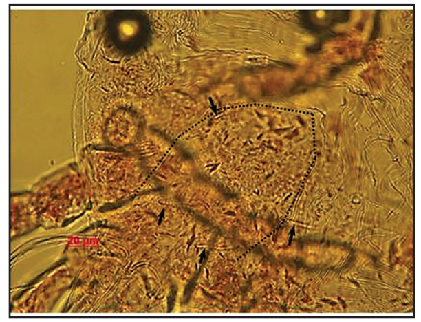
Figure 3a. Dorsal shield of Geckobiella donnae shaped as an inverted pentagon with anterior sides almost parallel (outlined) and 2 pairs of short setae (arrows) (x400).

suboptimal, and this would be a predisposing factor contributing to the onset of infection.