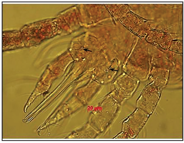
Figure 3b. Gnathosoma of Geckobiella donnae . Note the slender and long with a pair of smooth setae visible behind them (arrows) (x400).

Pterygosomatidae, the only family in the superfamily Pterygosomatoidea, comprises various species of bright red mites found primarily on lizards, tortoises, and arthropods all over the world. The described genera includes Cyclurobia, Geckobia, Geckobiella, Hirstiella, Ixodiderma, Pterygosoma, Scaphothrix, Teqttisistlana and Zonurobia, which are mostly external parasites of lizards. They attach under scales, between the toes, or in areas known as mite pockets and often are confused with chiggers. They feed on body fluids of their host and cause benign to severe pathological disorders such as anemia and intense skin irritation. Apparently, some species are vectors of protozoan diseases of lizards (Krantz and Walter, 2009). Geckobiella spp. (as well as other Pterygosomatids) is scansorial and not usually found in mite-pockets. These mites live under the imbricate scales of their hosts (Delfino et al., 2011). All instars of this genus are parasitic on the Iguanidae (Paredes-León et al., 2012). Parasitism by Geckobiella may cause problems during the molting process of their hosts and some species are potential vectors of Plasmodium and Haemogregarina (Murgas et al., 2013). The mites tend to localize around the eyes, under the chin, in the dewlap, axillary