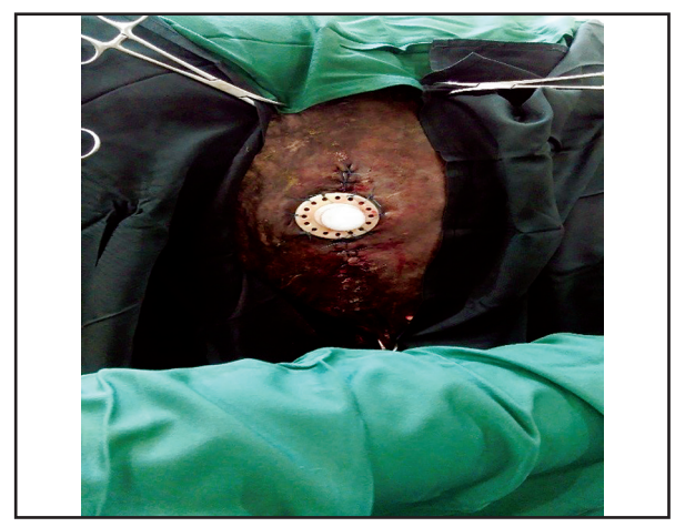
Figure 4. The cannula in place after fixation suture to the skin

moved by releasing the peripheral adhesions by similar anesthesia protocol in standing horses. The fistula was formed around the cannula. In this fistula, drains were placed to discharge secretions. Three weeks later, the healing of this fistula occurred by daily washing with normal saline. The health of the horses was followed after 8 months (at the time of writing the present article) of the second surgery. As a result, all of them are healthy and do not have any problem.