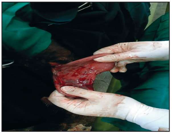
Figure 2. Identification of the cecum by palpation of the cecal base and the dorsoventrally oriented tenia.