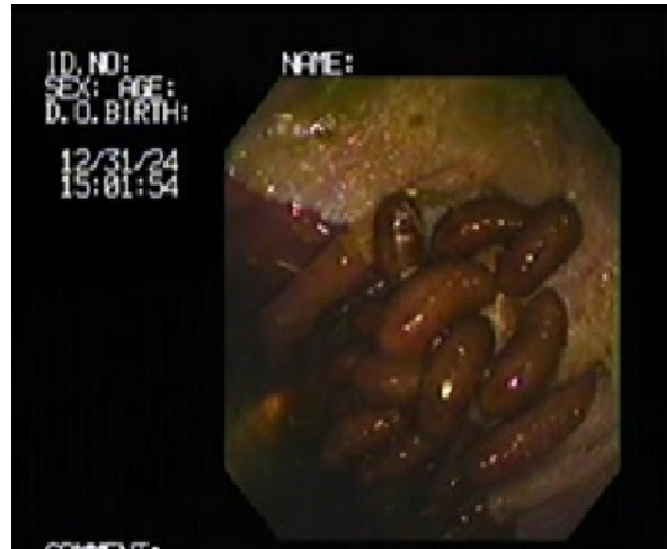
Figure 1. 12 years old mare with gastric ulcer (severity 2) and Gasterophilus spp.(botfly)