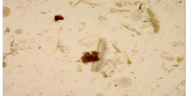
Figure 2. Fecal smear with B.coli cysts