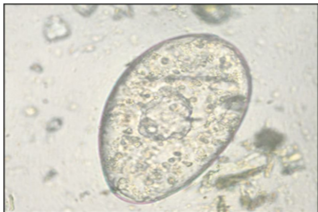
Figure 4. Fecal smear showing Amphistome egg