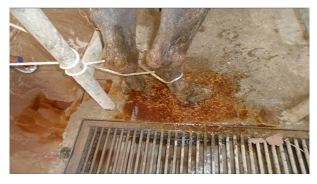
Figure 1. Animal with chronic diarrhea