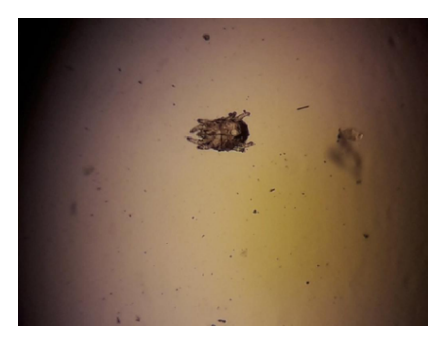
Figure 3. Cheyletiella spp. (using digital camera, x40 magnification)

ferences could be attributed to the number of animals examined and the management's performance. On the other hand, our results agreed with Shahatha et al. (2022), who reported that the infestation rate with S. scabiei in cows was 37.5%. The most frequent lesions in rabbits were hyperkeratosis on the head and ears (26.8%), then