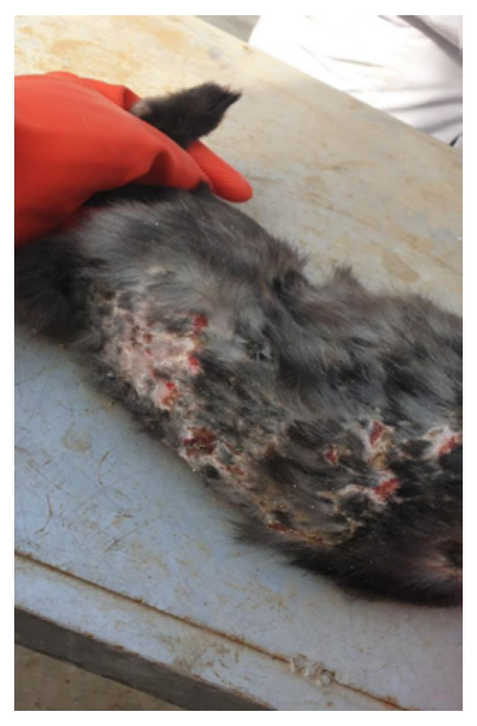
Figure 4. Hyperkeratosis and alopecia on animal's back

the abdomen and back (57.1%), and finally on the legs (44.6%), while the alopecia came in the second place after hyperkeratosis and its rates are 26.8% on the head and ears, 57.1% on the abdomen and back, and 19.6% on the tail and perineal areas.