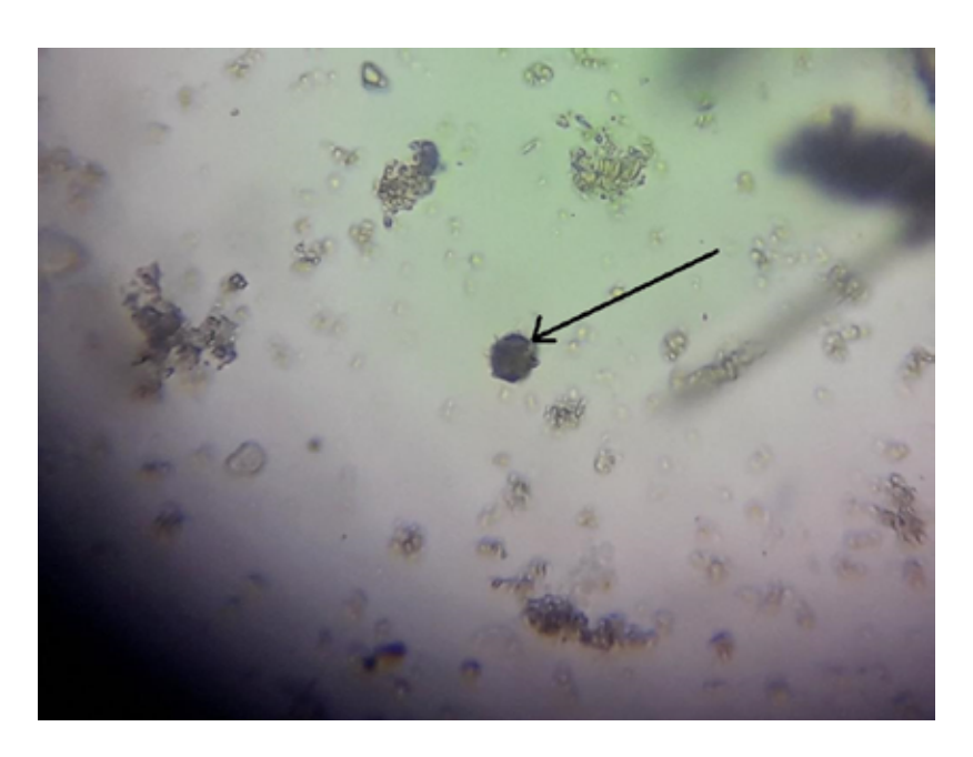
Figure 1. S. scabiei cuniculi (using a digital camera)

teristics of S. scabiei var. cuniculi , such as size, which ranged between 320-500 \mu m in length and 250-410 \mu m in width. These results agreed with that of Elshahawy et al. (2016), who found that the size of S. scabiei var. cuniculi was 300-504 \mu m in length and 230-420 \mu m in width. Psoroptes cuniculi have an oval body shape with pointed mouth parts, as described by Nonga and Mkula (2015). Results of the current study revealed other morphological characteristics of N. cati var. Notoedres cati , D. cuniculi , and Cheyletiella spp, which were similar to those found by Elshahawy et al. (2016).