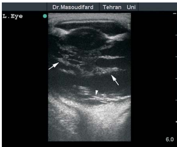
Figure 4: Ultrasonographic scanning of the left eye in a Thoroughbred stallion. Swirling echogenic materials including vitreal debris and fibrin in the vitreous (arrows) and partial retinal detachment (arrowhead) were found.