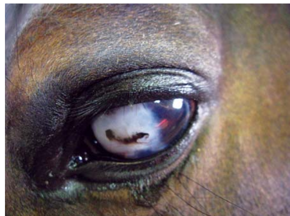
Figure 2: Traumatic induced corneal scarring and pigmentation in the right eye of an 8-year-old mixed breed mare.

Corneal edema due to corneal endothelial damage, which initially is not associated with corneal ulcer and was fluorescein-negative, was diagnosed in three horses with ERU, and in one horse with nonulcerative keratitis. In one of the patients with ERU-induced corneal endothelial dysfunction and corneal edema, rupture of epithelial bullae eventually led to corneal ulceration, possibly as a result of self-trauma. A fluorescein-negative corneal vascularization and edema were the main signs detected during ophthalmologic examination of an Arabian mare with a history of recurrent ocular disease. Ultrasonographic examination of the affected eye revealed that no other ocular compartment was affected. Nonulcerative keratitis and corneal lesions were controlled with topical dexamethasone. Intraocular melanoma was diagnosed in a 7-year-old grey gelding; there were also lesions in the cervical area and the