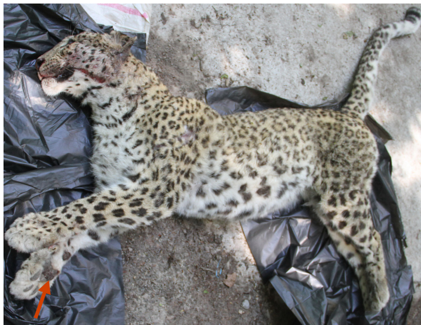
Figure 1. Grayish-white dermal nodule on the right toe in Persian leopard (arrow).

A seven-year-old female Persian leopard was dead because of accidents a road-kill in Golestan National Park, Iran, in May 2014. Following necropsy, skin mass on the sideline of the right toe was observed. The mass was dissected in necropsy. The resected mass sample was grayish-white in color and measured 2×2×1.5cm, with necrosis at the cut surface (Figure 1). The sample was fixed in 10 % buffered formalin. Serial sections of the formalin-fixed, paraffin-embedded sample were produced and serial sections were cut, using a rotary microtome (Leitz, 1512, Germany) at 5 µm. The samples were stained by routine hematoxylin and eosin (HandE) and CD34 immunohistochemical staining.