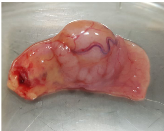
Figure 2. Removed testicle with fat pad, connective tissues, and epididymis

plate. This plate was gently aspirated and diluted to 1 \times 10^6/\text{mL} . Prior to IVF, the sperm capacitation procedure was done by incubation of the spermatozoa for 4 h in capacitation medium which contained caffeine and dibutyryl cyclic AMP (Boatman and Bavister, 1984). At this point the spermatozoa were ready for fertilization of the matured oocytes.