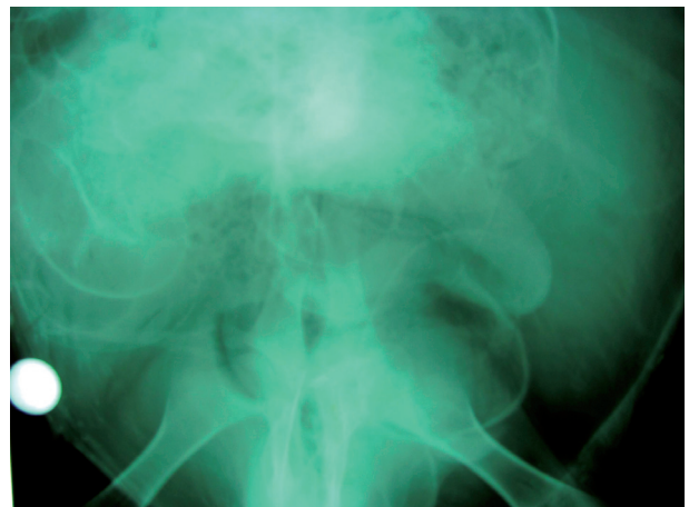
Figure 3. Ventrodorsal radiograph showing narrowed pelvic canal with attached iliac wings.

events at one or more stages during the complex transitions of embryonic and fetal development (Greene, 1973). Bovine inbreeding has increased the percentage of congenital defects in this species