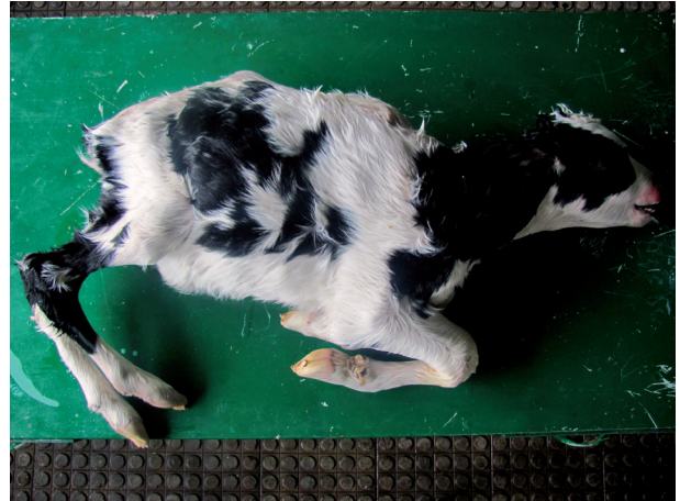
Figure 1. A Perosomus Elumbis calf with angular hind limb and lumbar deformities.

Congenital defects can result from disruptive